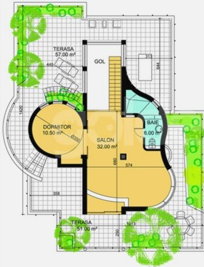
PLAN ETAJ 3

GoldenKey Premium Real Estate | Bringing you home... since 2006